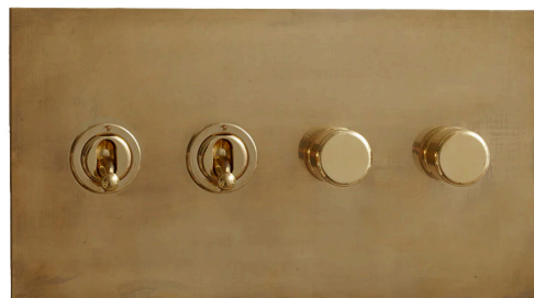
Examples of third party pushbuttons to be used in conjunction with the K-ZC-WDW-000.