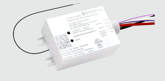
20A Load Controller