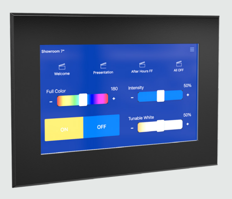
7" Touchscreen Black Trim

Touchscreens' appearance can be modified through the Configuration menu. Options include color scheme, button sizes, background image and screen saver mode.